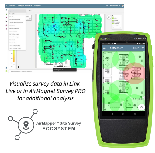
AirMapper Site Survey App on the AirCheck G3

*NOTE: Wi-Fi 6/6E regulatory compliance implementation of the 6GHz spectrum varies by country. AirCheck G3 models are available in three versions; see Models and Accessories for additional information.